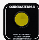
Automatic condensate drain