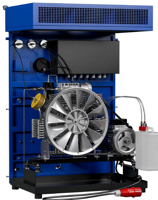
SUPER SILENT TPS 315 ET