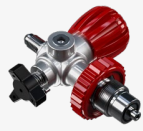
2 filling connections DRV DIN 300 bar