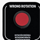
Phase controller that prohibits reverse rotation