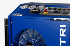
Frame color Blue RAL 5002