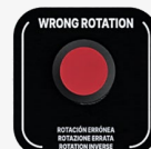
Phase controller that prohibits reverse rotation