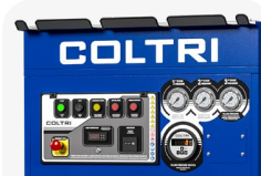
Frame color Blue RAL 5002