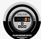
Electronic pressure switch with automatic switch-off