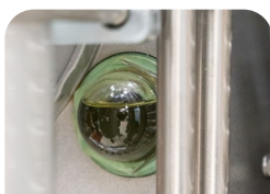
Oil sight glass with autostop