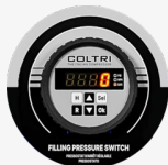
Electronic pressure switch with automatic switch-off