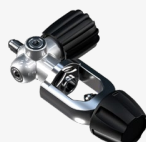
2 filling connections DRV INT/YOKE 232 bar