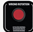
Phase controller that prohibits reverse rotation