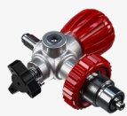
2 filling connections DRV DIN 300 bar