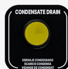
Automatic condensate drain