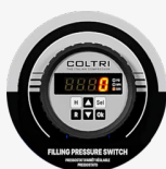
Electronic pressure switch with automatic switch-off