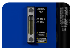
Oil sight glass with autostop