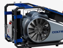
Frame color Blue RAL 5002 + Carrying handles