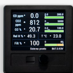
SAM sensors \text{CO} + \text{CO}_2 + \text{H}_2\text{O} . Available in version with VOC