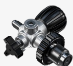
2 filling connections DRV DIN 232 bar