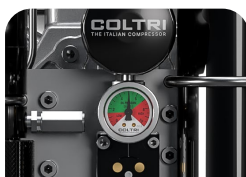
Oil pump with filter and pressure gauge