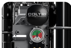
Oil pump with filter and pressure gauge