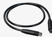
2 filling hoses of 1.2 m length