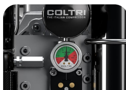
Oil pump with filter and pressure gauge