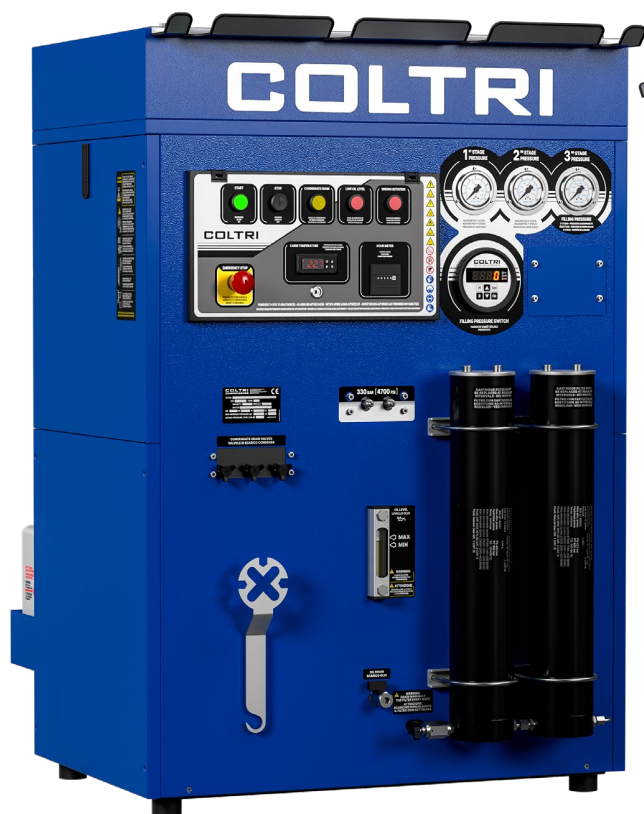
SUPER SILENT TPS 235 ET